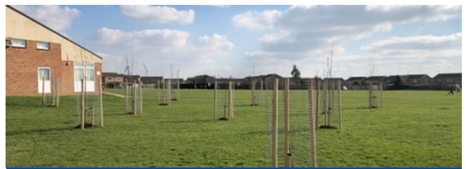
We welcome this recent tree planting near the Community Centre. KBC's Conservative administration is well underway to delivering our commitment to doubling tree planting in our Borough from 250 to 500 each year.