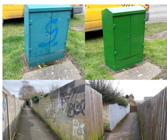
✓ Graffiti removal around the ward: delivered!