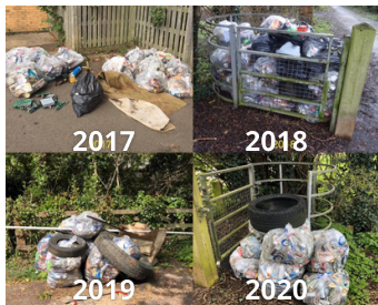
✓ Regular community litter picks: delivered!