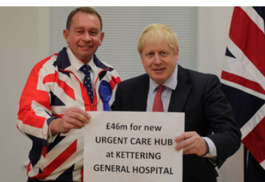
▲ Photo: Prime Minister Boris Johnson with Kettering's MP Philip Hollobone

HM Government has substantially strengthened KGH's finances with a complete write-off of the Trust's £167m debt.