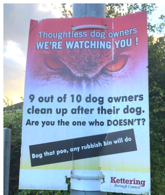
✓ Signage, new bins & more warden patrols to help tackle dog fouling and litter: delivered!