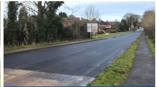
▲ Photo: We continue to fight for road repairs on your behalf, such as the recent resurfacing of the A4300 in Geddington.