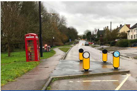
▲ Photo: Your local Conservative councillors tirelessly lobbied for speed calming in Cranford St. John