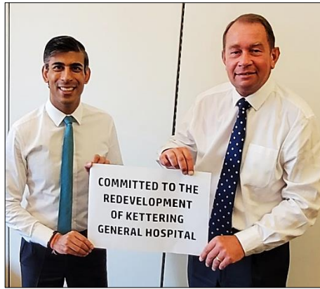
Rt. Hon. Rishi Sunak MP