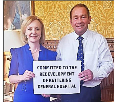
Rt. Hon. Liz Truss MP

Philip Hollobone MP writes: All of us as KCCA members face a real responsibility over the next few weeks in deciding who should become the next Leader of the Conservative Party and hence Prime Minister. At stake is the future direction of HM Government's policies and our chances of victory at the next General Election and a record fifth term.