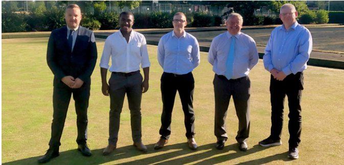
▲ PHOTO: Your local Conservative Town and Unitary Councillors (details overleaf)

As your local Conservative councillors we are very pleased to have been able to secure a significant £30,250 investment to improve the Ise Lodge Bowls Pavilion.