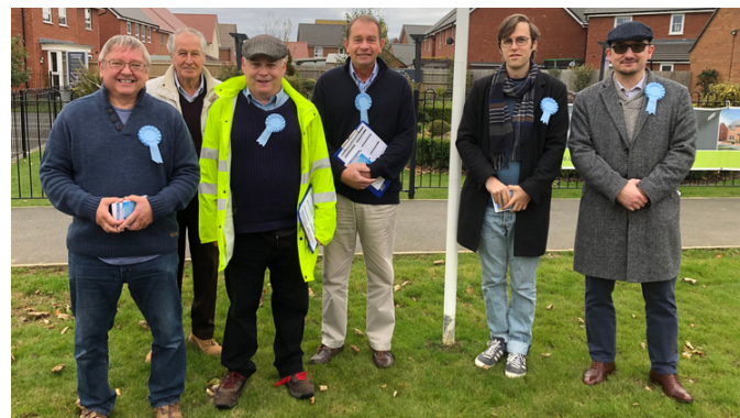
▲ PHOTO: Some of your local Listening Team, out and about in Ise Ward recently speaking to residents and listening to their concerns.